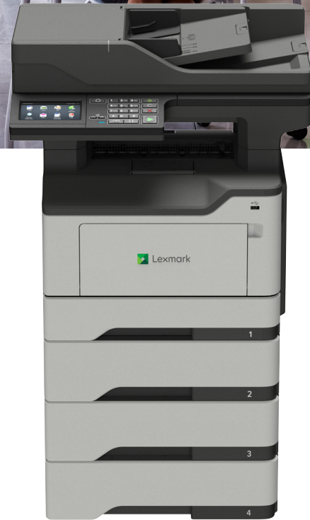
MX522adhe with optional trays